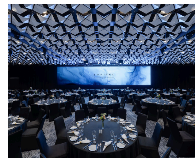
The Grand Ballroom