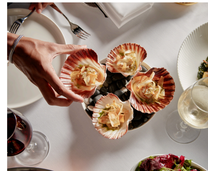
No35 Restaurant, Level 35

As you dine, floor-to-ceiling windows frame sweeping views of the city skyline and Port Phillip Bay, creating a setting where every meal feels special. Warm service, thoughtful wine pairings and a touch of French sophistication combine to deliver an experience that is both elegant and inviting, a true reflection of the city's cosmopolitan soul.