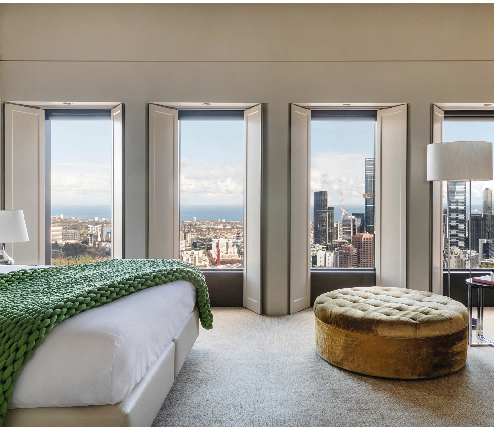
Opera Suite, Level 50