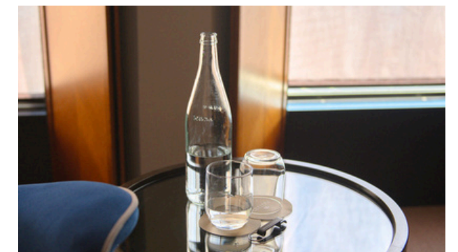
In-Room MODA Refillable Water Bottle

Sofitel Melbourne On Collins is proudly certified Green Globe, EcoStar, 5 Star Quality Tourism Accredited Business, and Sustainable Tourism Accredited Business. Our sustainability journey is ongoing, driven by innovation, community engagement, and a commitment to responsible luxury.