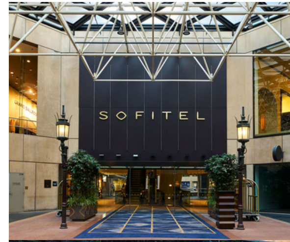
Entrance of Sofitel Melbourne On Collins

Rising above Collins Street, our 363 rooms and suites offer a sanctuary of contemporary comfort and timeless sophistication. Floor-to-ceiling windows frame sweeping views of Melbourne's skyline and Port Phillip Bay, while French-inspired décor and modern touches create spaces that are both stylish and welcoming.