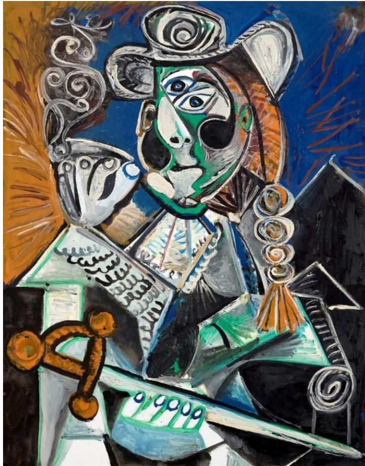
Pablo Picasso, Spanish 1881–1973, worked in France 1904–73. The matador (Le Matador) 4 October 1970, oil on canvas. 145.0 × 114.0 cm. Musée national Picasso-Paris. Donated in lieu of tax, 1979 (MP223) © Succession Picasso/Copyright Agency, 2022.